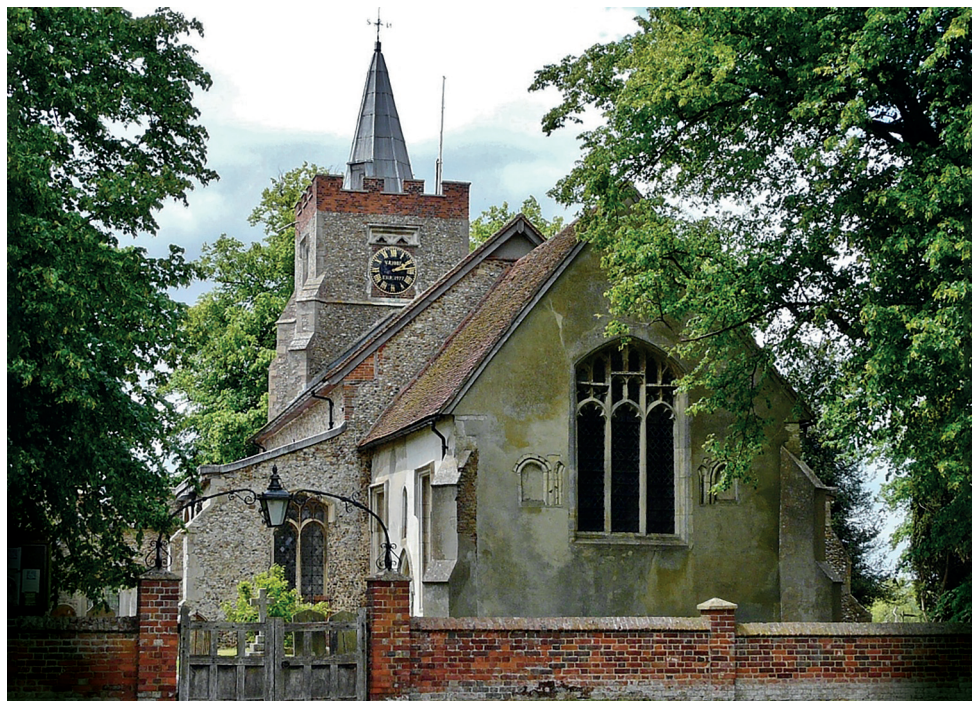
Henham, St Mary the Virgin