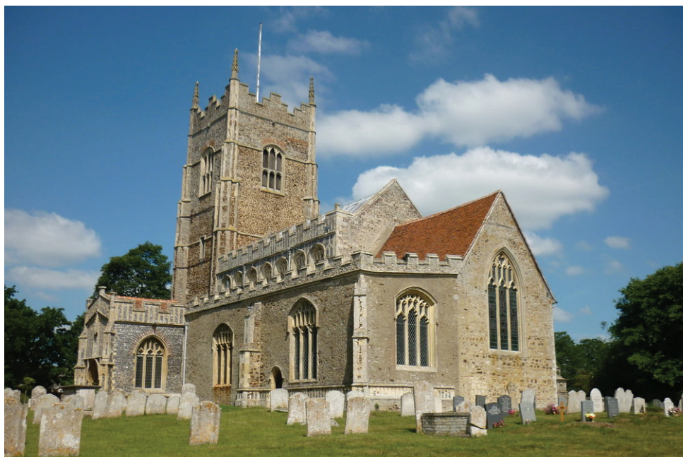
Provision of servery at Great Bromley, St George.