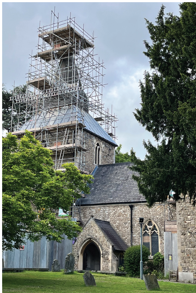
Roof repairs and rainwater goods at Upminster, St. Laurence.

Supporting Churches in Essex and East London