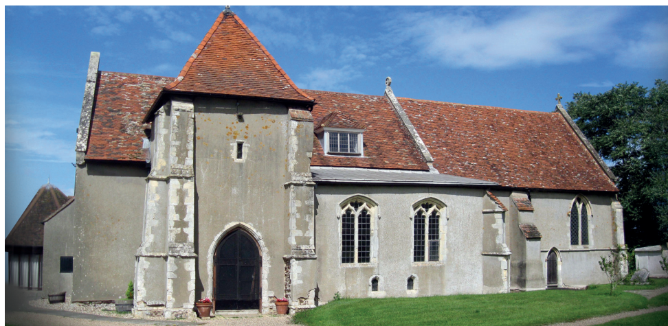
Elmstead, St Anne and St Laurence