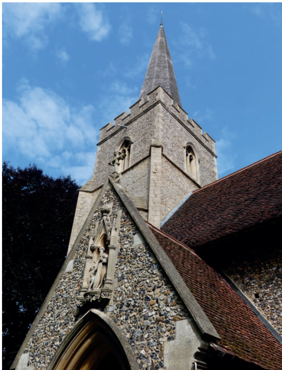
Tower repairs at Great Hallingbury, St Giles.