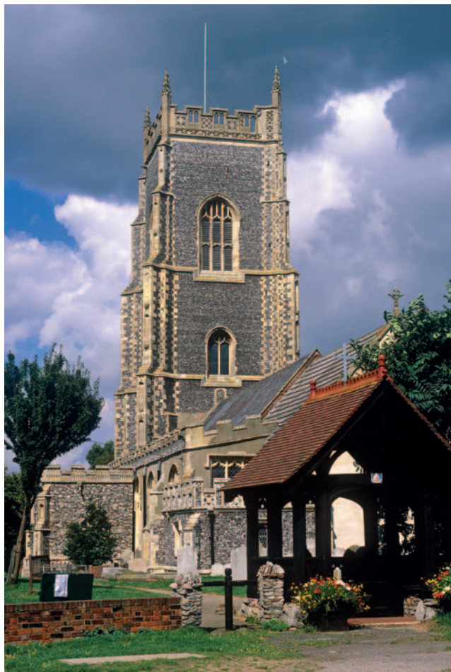
Tower repairs at Brightlingsea, All Saints.