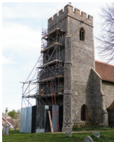
Repairs to tower stonework at Bulmer, St Andrew.