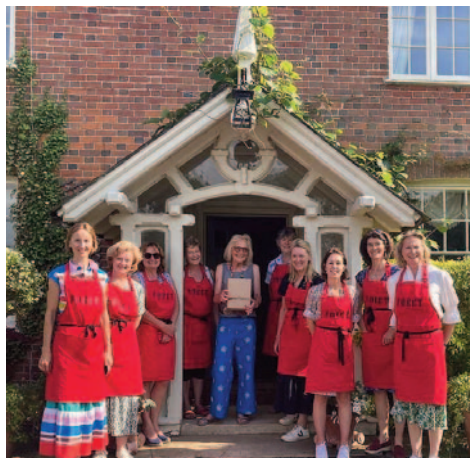
The Garden Open Day at Garlands, Steeple Bumpstead.