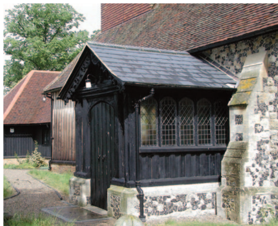
Porch repairs at Bulphan, St Mary the Virgin.