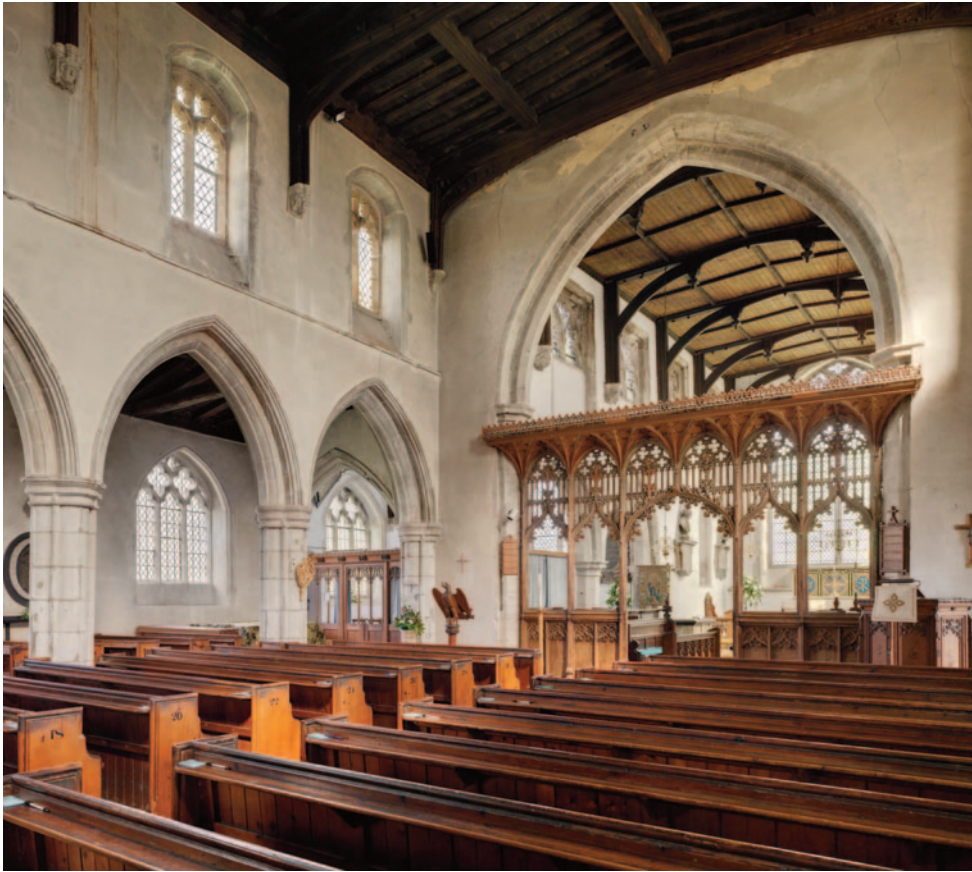
Roof repairs to north and south chapels at Finchingfield, St John the Baptist.