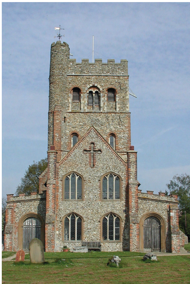
Floor repairs at Great Tey, St Barnabas.

Caring for Christian churches and chapels in Essex and East London