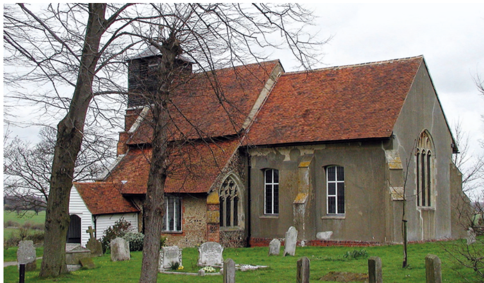
Window masonry repairs at Buttsbury, St Mary.