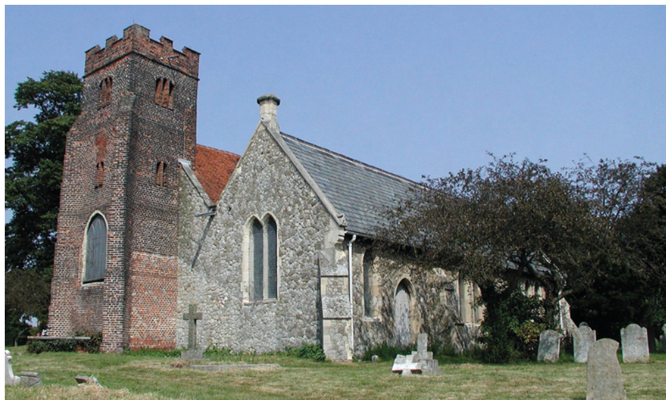
Retiling of nave roof at Greenstead (Colchester), St Andrew.