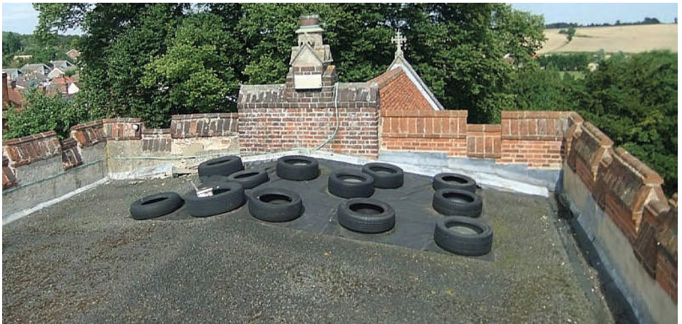
Nave roof prior to repairs at Wethersfield, St Mary Magdalene.

For us the highlight of the evening was being presented with a cheque for £1,042 raised for Ride+Stride by a parishioner (and her parents) on a wheelchair bike, a truly epic achievement. You can read more about the repairs at Wethersfield on the 'Our Projects' page of the website.