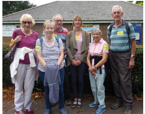
Striders from Upminster, St Laurence.

vaccines reduced the risks of the delta variant spreading, there was a general understanding that outdoor activities were to be encouraged, that there were many people longing to resume taking exercise for a good cause, and that churches were most unlikely to be contaminated by visitors who were merely passing through. In the event, those of us who did get on our bikes on 11th September had good weather and an enjoyable outing. I was very grateful to those churches who were open, and those providing refreshments were even more appreciated.