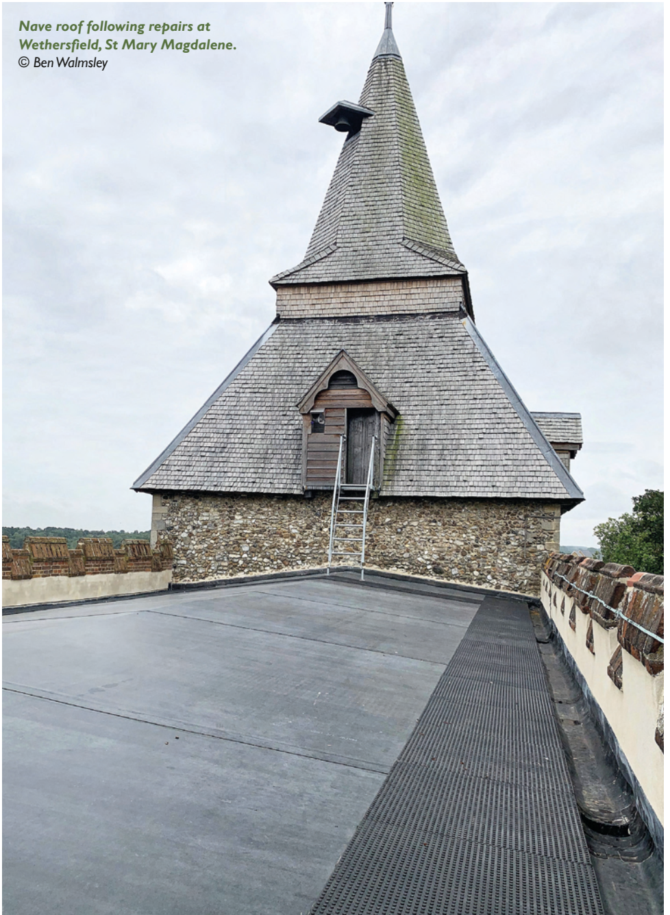
Nave roof following repairs at Wethersfield, St Mary Magdalene.