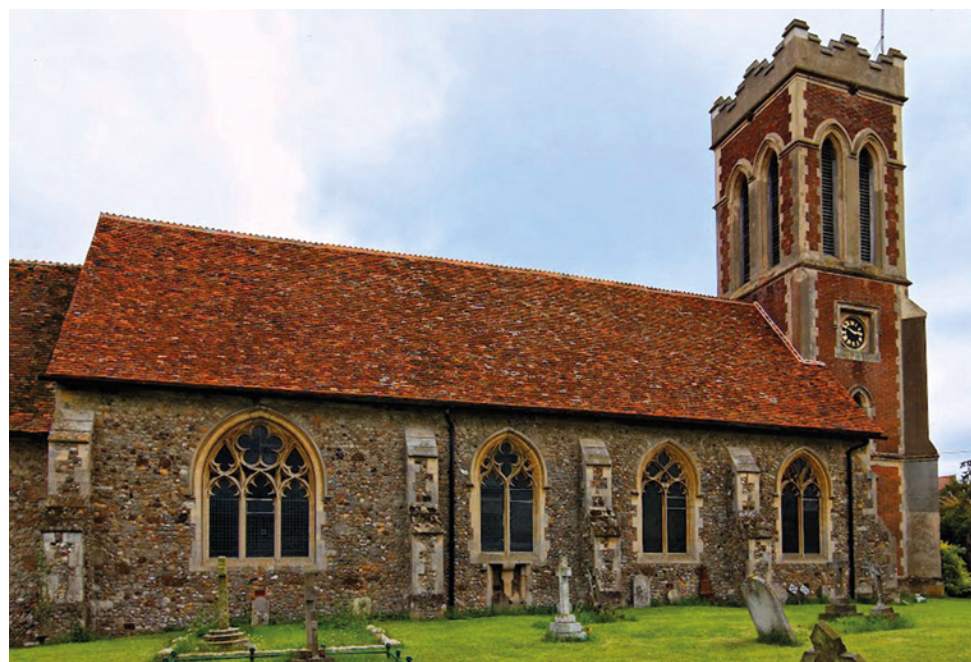
Roof repairs to chancel at Messing, All Saints.