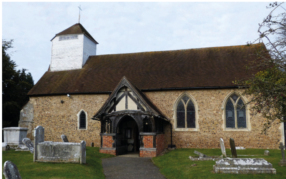
Roof repairs at Little Clacton, St James.