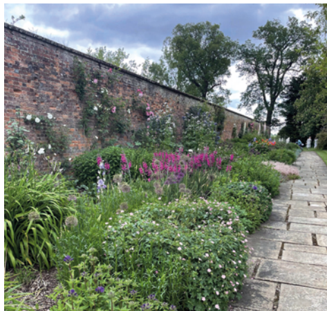
Herbaceous border at Blake Hall.