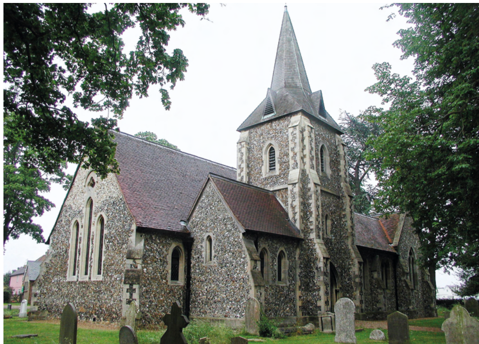
Guttering and associated repairs at Hatfield Heath, Holy Trinity.