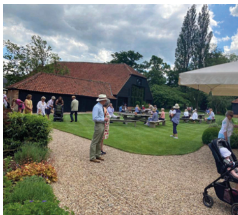
The Garden Open Day at Blake Hall.

In the pipeline for 2022, we look forward to a Study Day on 11th May, our Garden Open Day on 16th June at Steeple Bumpstead and a bit of cycling in September too!