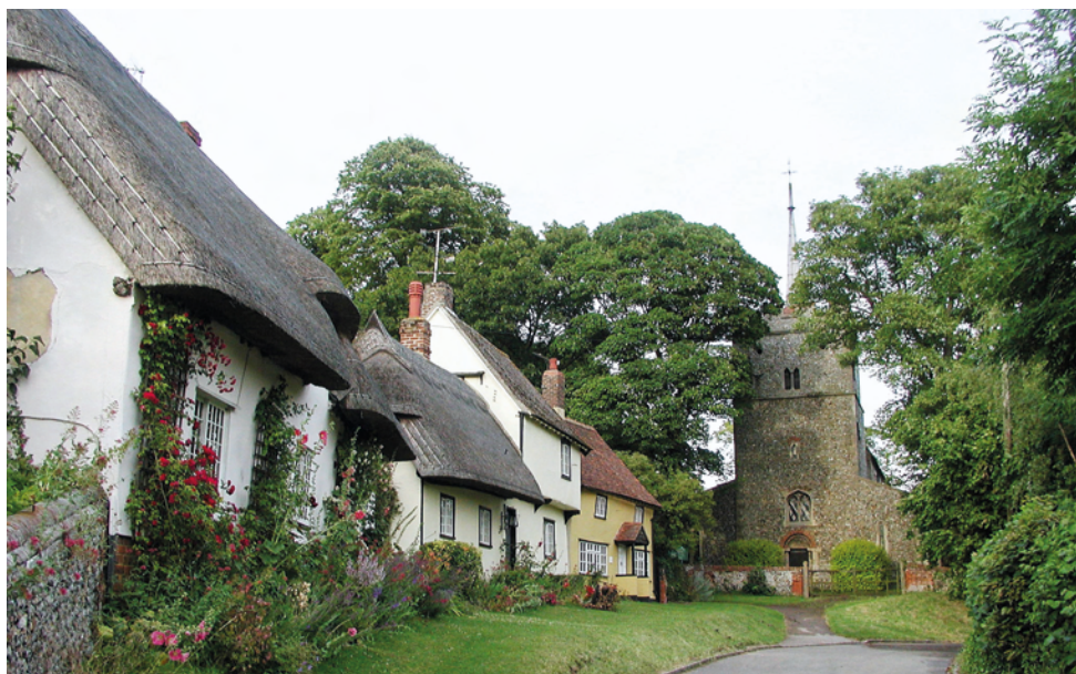
Roof repairs to chancel at Wendens Ambo, St Mary the Virgin.