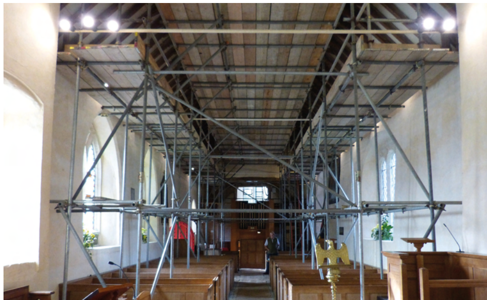
Roof repairs at Little Clacton, St James.