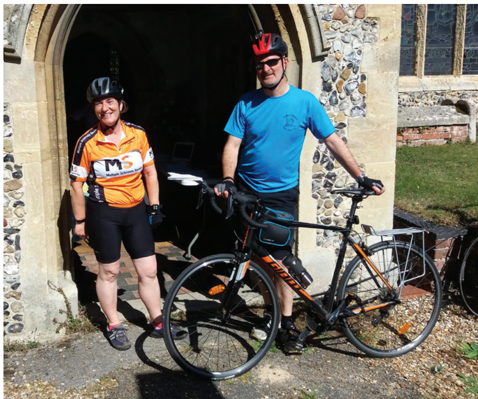
Wendens Ambo, St Mary the Virgin.