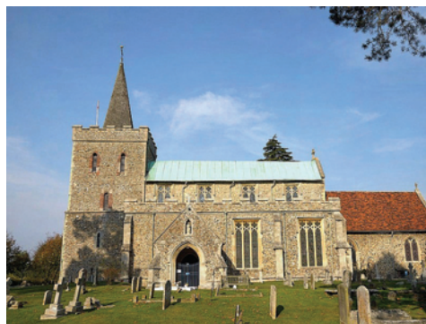
Great Bardfield, St Mary the Virgin.