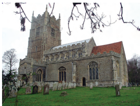
Floor repairs at Great Bromley, St George.