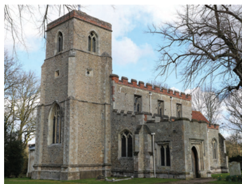
Replacement of stolen lead at Shalford, St Andrew.