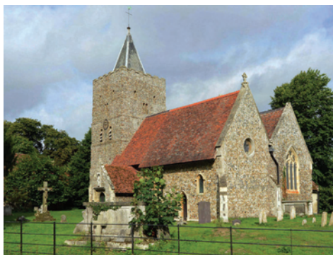
Little Bardfield, St Katharine.