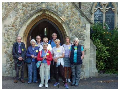
Upminster, St Laurence.