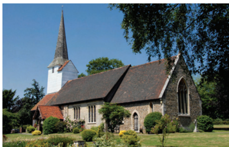
Stock, All Saints.