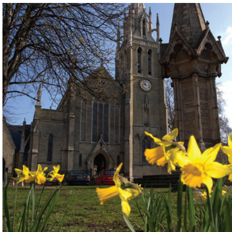
Springtime at Stratford, St John the Evangelist.

Chairman – Friends of Essex Churches Trust