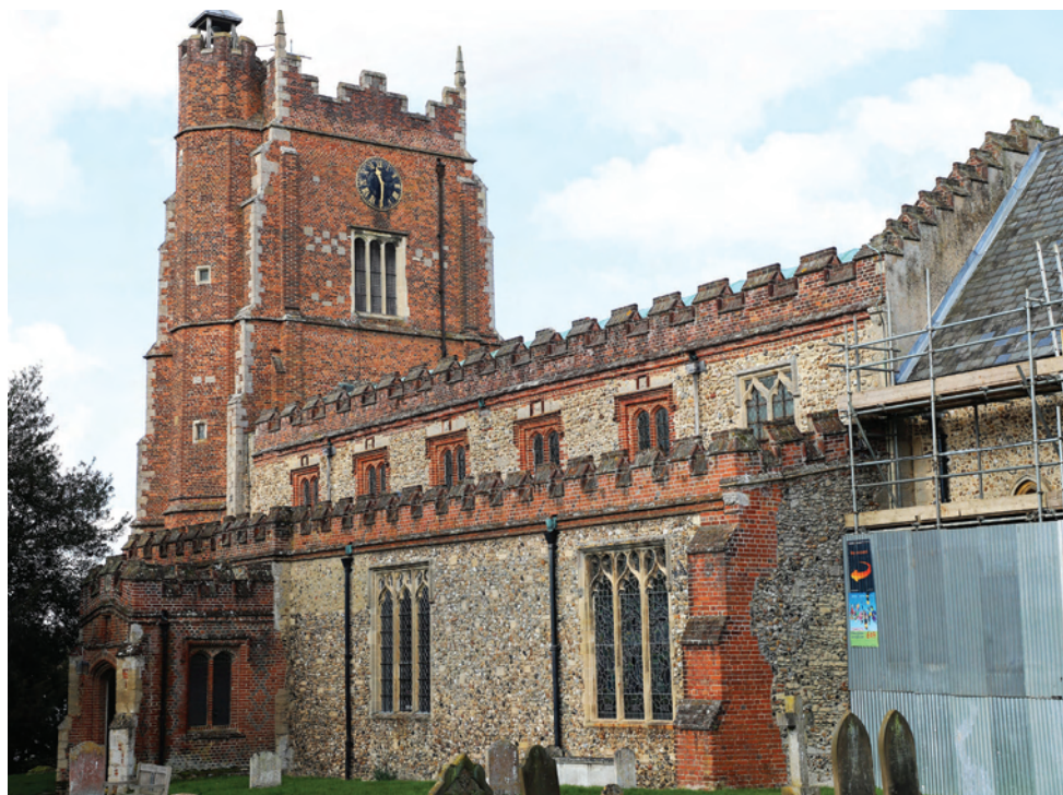
Roof repairs in progress at Castle Hedingham, St Nicholas. © Martin Stuchfield