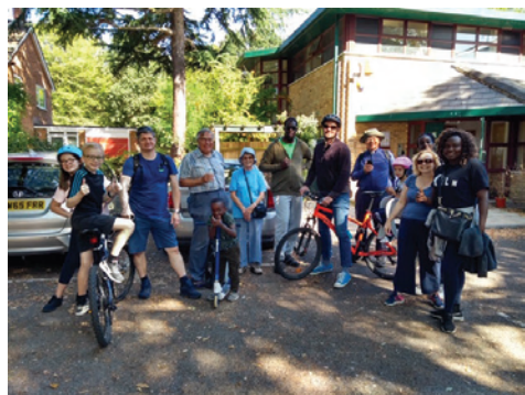
South Woodford, Holy Trinity.