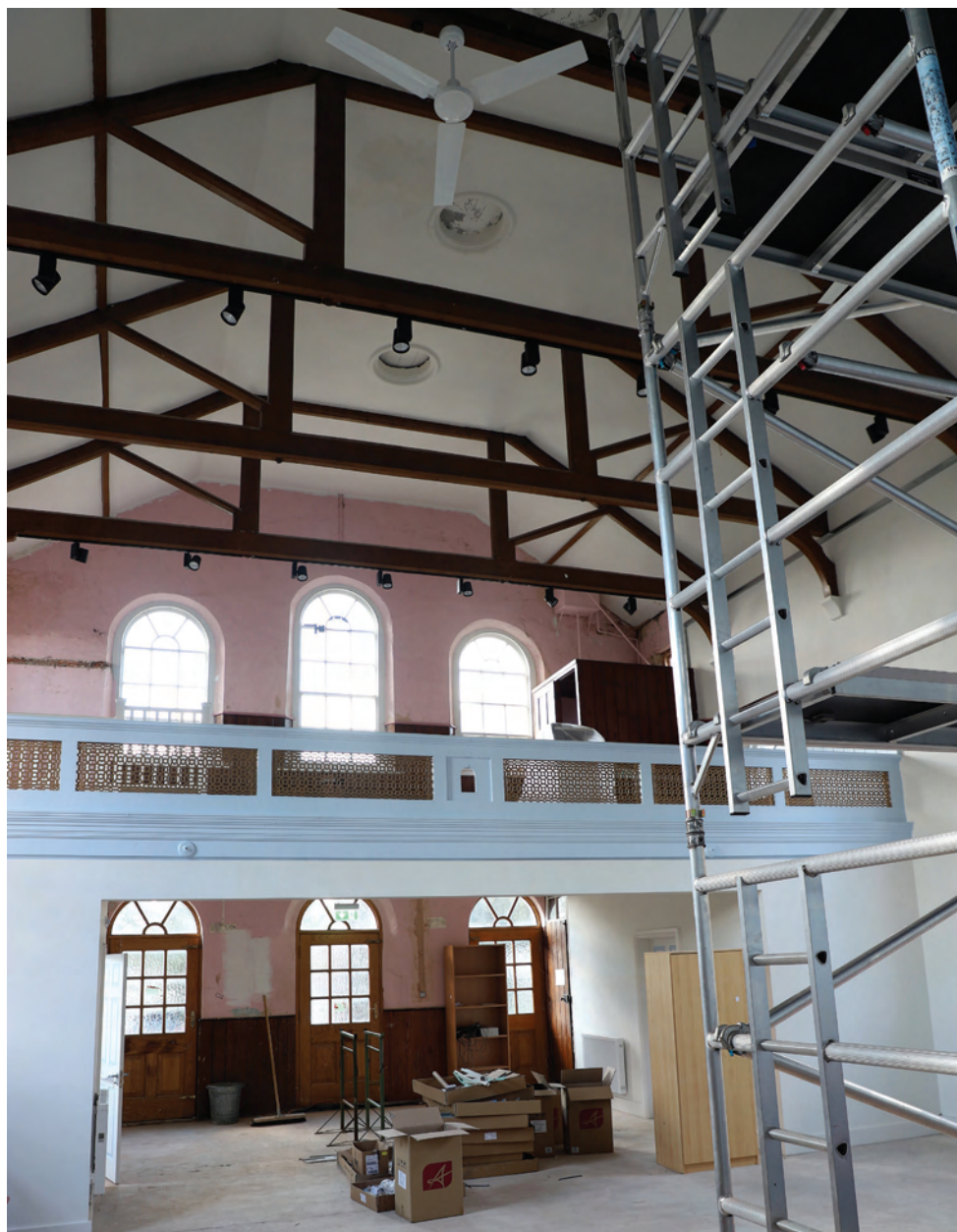
Replacement of windows and masonry repairs in progress at Great Sampford, Baptist Church.