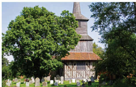
Blackmore, St Laurence.

Find full and updated details of events at www.friendsofsexchurches.org.uk/events .