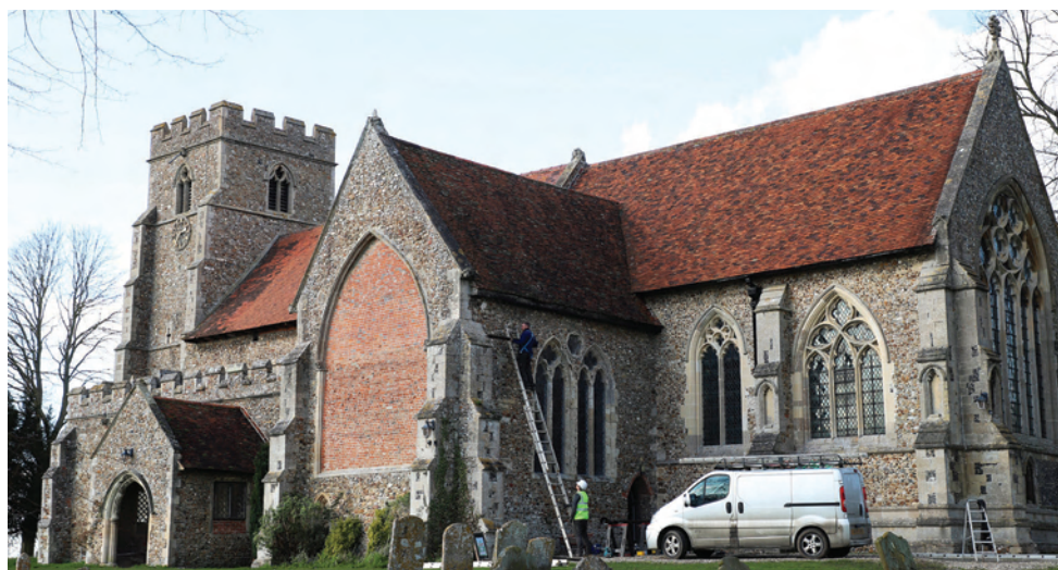
Roof repairs and replacement of rainwater goods at Great Sampford, St Michael.