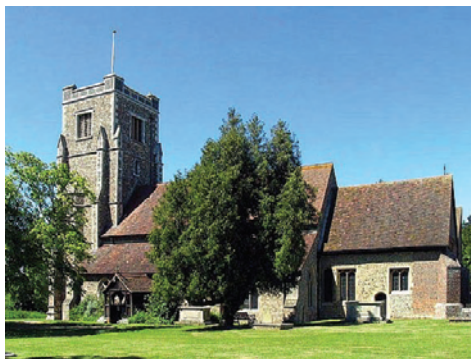
Hempstead, St Andrew.