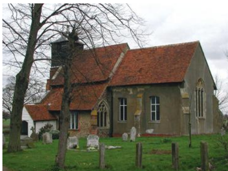
General external repairs at Buttesbury, St Mary.