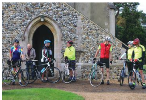
I'm sure someone must have a map. © Clifford Want