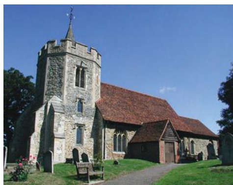
Plaster work to chancel and nave at Hockley, SS Peter & Paul.