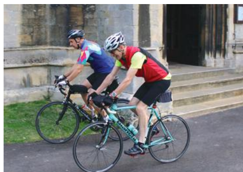
Only 10 more cakes until lunchtime.