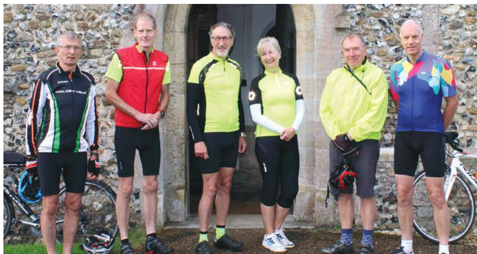
Start of Day 2 in Great Chesterford.