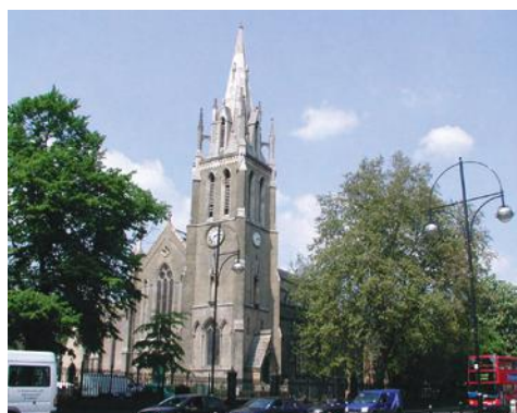
Nave ceiling replacement at Stratford, St John.