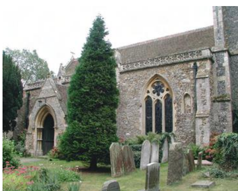
Stabilisation of the east wall at Kirby-le-Soken, St Michael.