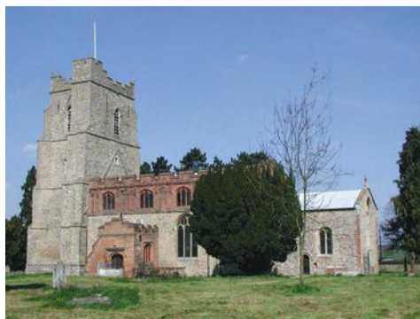
High Easter, St Mary the Virgin.