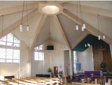
Kitchen and lavatory improvements at Holland-on-Sea, St Bartholomew.