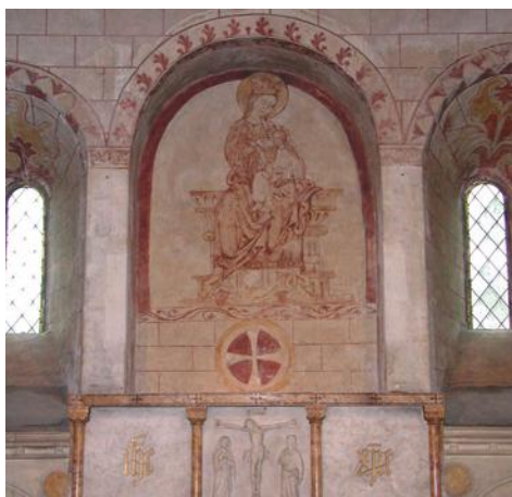
Great Canfield, St Mary the Virgin.

the noteworthy stained glass and the nineteenth-century tomb chests in the churchyard in memory of the Constable and Boggis-Rolfe families. Our second church was St John the Baptist, Mount Bures, which is unusual as it stands between the manor house and an eleventh-century castle mound at the foot of which a high-status Iron Age burial which was found in 1849. All Saints, Middleton, came next and the recent theft of the unique Tudor royal arms was discussed. Sadly, thefts from churches are becoming more frequent, and irreplaceable treasures are being lost at an alarming rate. After lunch we visited Holy Innocents, Lamarsh, one of the six churches in Essex with a round tower. The last church of the day was St Barnabas, Alphamstone, where we saw the recently-restored chancel and nave of this lovely out-of-the-way church. Our visit concluded with a splendid tea in the village hall.