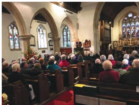
Our Autumn Study Day at Wormingford, St Andrew.