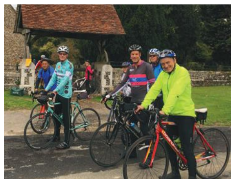
The tour leaders pause outside Great Canfield, St Mary the Virgin.