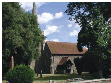
Tower and roof repairs at Aldham, SS Margaret & Katherine.

We made grants to churches as scattered as Clacton, Little Yeldham and Stratford. There is no part of the historic county of Essex where we are unwilling to help. The largest repair grant we made in the year was £12,500; the smallest £2,000. For improvements the largest grant was £10,000 and the smallest £2,000.