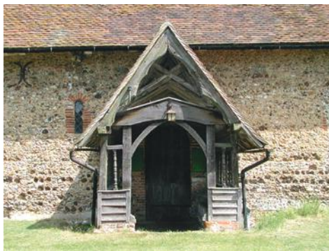
Bradwell-juxta-Coggeshall, Holy Trinity.