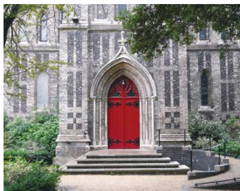
Roof and masonry repairs at Chingford, SS Peter & Paul.