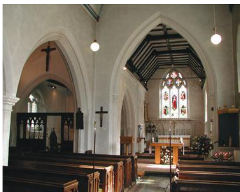
Retiling and rainwater goods at Corringham, St Mary the Virgin.