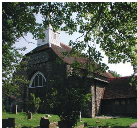
Woodham Ferrers, St Mary.