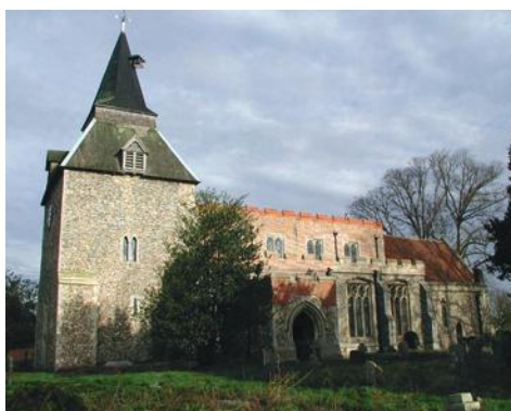
Spire re-tiling at Wethersfield, St Mary Magdalene.