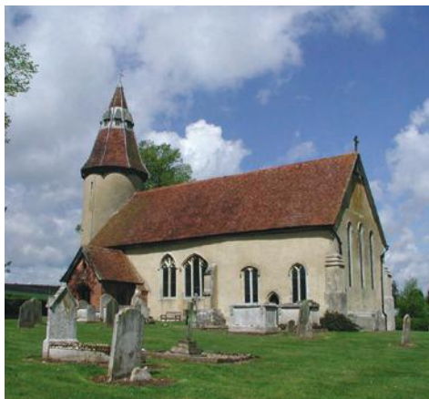
Lamarsh, Holy Innocents.

Chairman – Friends of Essex Churches Trust