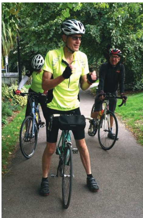
The Archdeacon exhorts his flock.