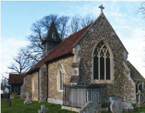
Improved access for those with disabilities at Little Yeldham, St John the Baptist.