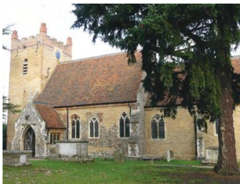
Wormingford, St Andrew.