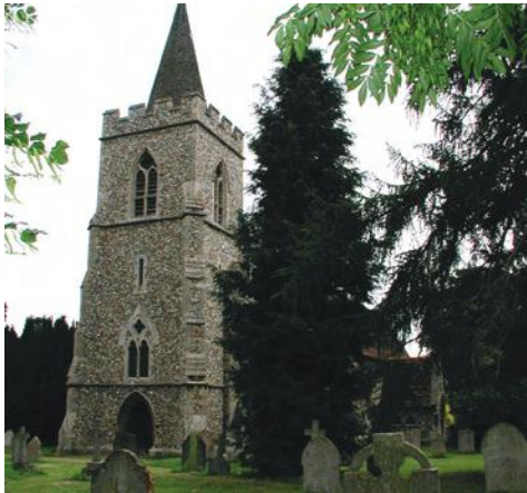
Clay tile replacement at Manuden, St Mary the Virgin.