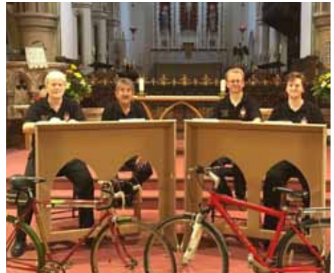
SongCycle – the ‘all cycling, all singing’ male voice quartet celebrated their 20th anniversary by singing all 150 psalms at the Church of St Thomas of Canterbury in Brentwood. They raised more than £4,200. Watch their video at http://ow.ly/6XwG309fTBN .

Despite two weeks of golden late-summer sunshine beforehand, the BBC weather forecast for 10 September 2016 was not encouraging, and the predictions of