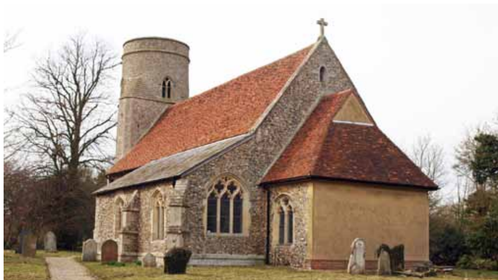
St Peter and St Paul's Church in Bardfield Saling, one of six round tower churches in Essex