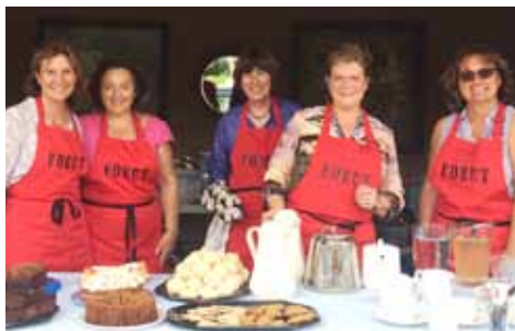
In praise of cake: Our friendly events team in action

our patrons, performed the opening ceremony and, leading by example, found much to buy. Attendance was at a record and commission from sales increased by more than 15%.