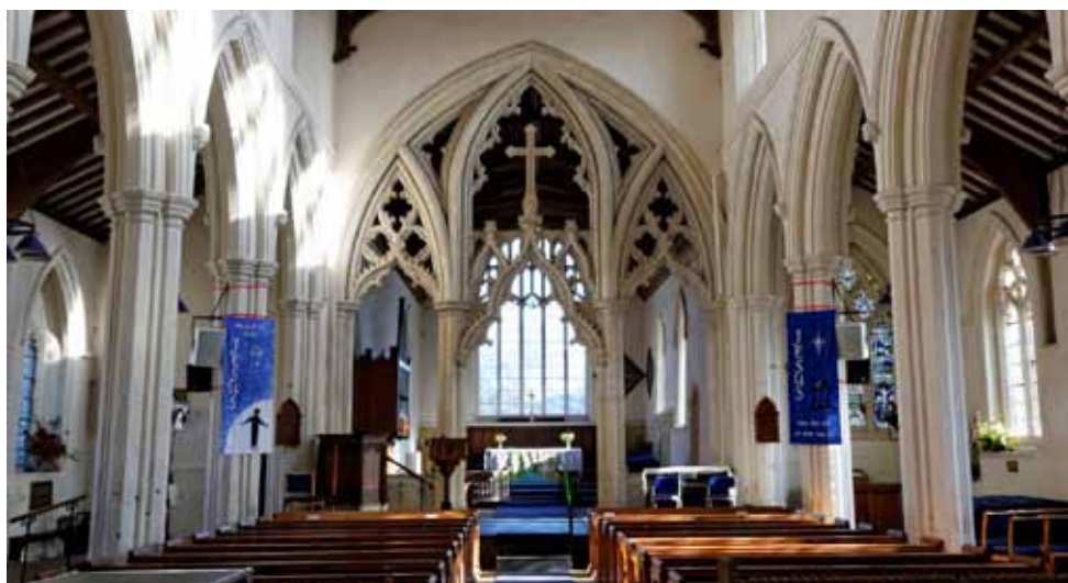
The Church of St Mary the Virgin in Stebbing. The stone rood screen is very rare.