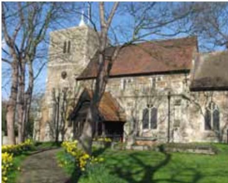
The Church of St Mary the Virgin in South Benfleet was awarded £10,000 for repairs to the South aisle roof

The Grants Committee met as usual on four occasions and were kept busy at each meeting. Each parish applying for a