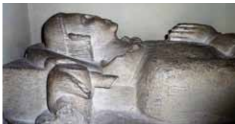
Resting in peace since about 1320 AD: Effigy of a priest at St John's church in Little Leighs

We aim to raise £1,000 for the Trust on each Study Day as well as providing historical and