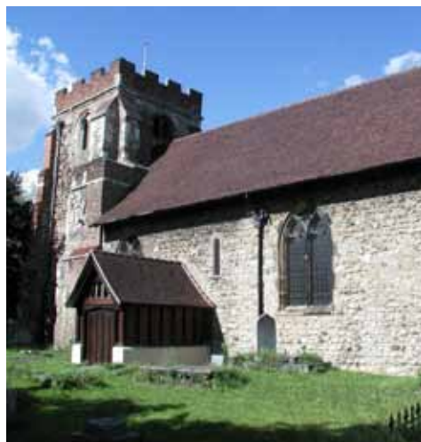
Church of St Mary Magdalene church in East Ham