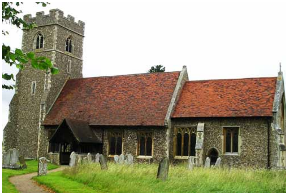
St Christopher's Church in Willingale was awarded £15,000 for roof repairs