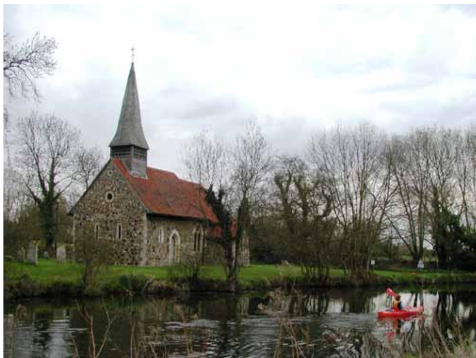
All Saints' Church in Ulting