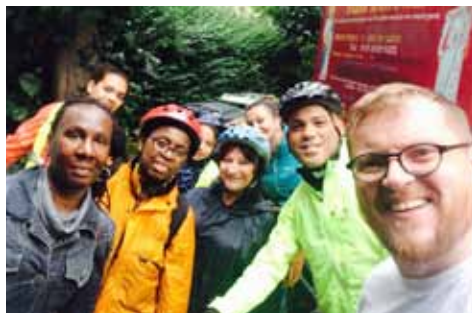
The rain did not dampen the spirits of this team from St Barnabas' church in Walthamstow

For the record, Sunday 11 September 2016,