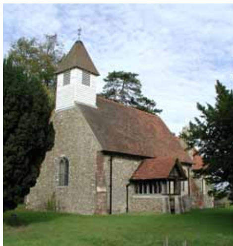
All Saints' Church in Norton Mandeville