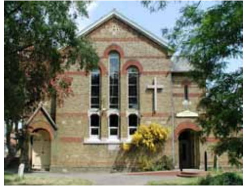
The Congregational Church, Tollesbury, was designed by Charles Pertwee of Chelmsford in 1864. The new building was estimated to cost £1,165. We awarded a grant of £3,000 for roof repairs.

It is hoped that the coming year will continue to present the committee with an interesting variety of applications. As in previous years all denominations are encouraged to reply.