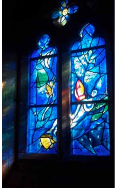
Window by Marc Chagall at Tudeley Church

On our last trip, in September, we stopped at Perrywood Garden Centre for morning coffee before visiting Layer Marney Church. After her talk, the speaker kindly took us up to the Terrace to see the Tower and the view across to the Blackwater.