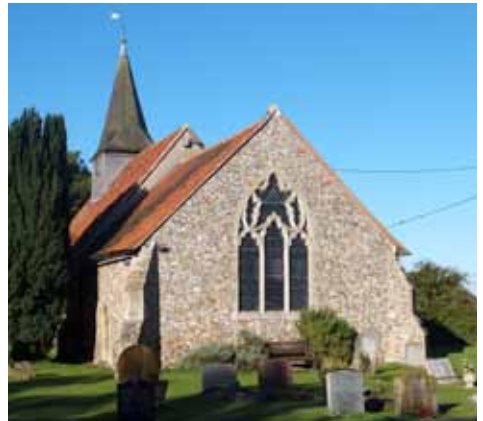
St Michael and All Angels, Leaden Roding, of Norman origin, with a 16th-century timber belfry. The east window, seen here, dates from the restoration of the church in 1907-8 by Chancellor & Son. We awarded a grant of £1,000 for repairs to the spire shingles.