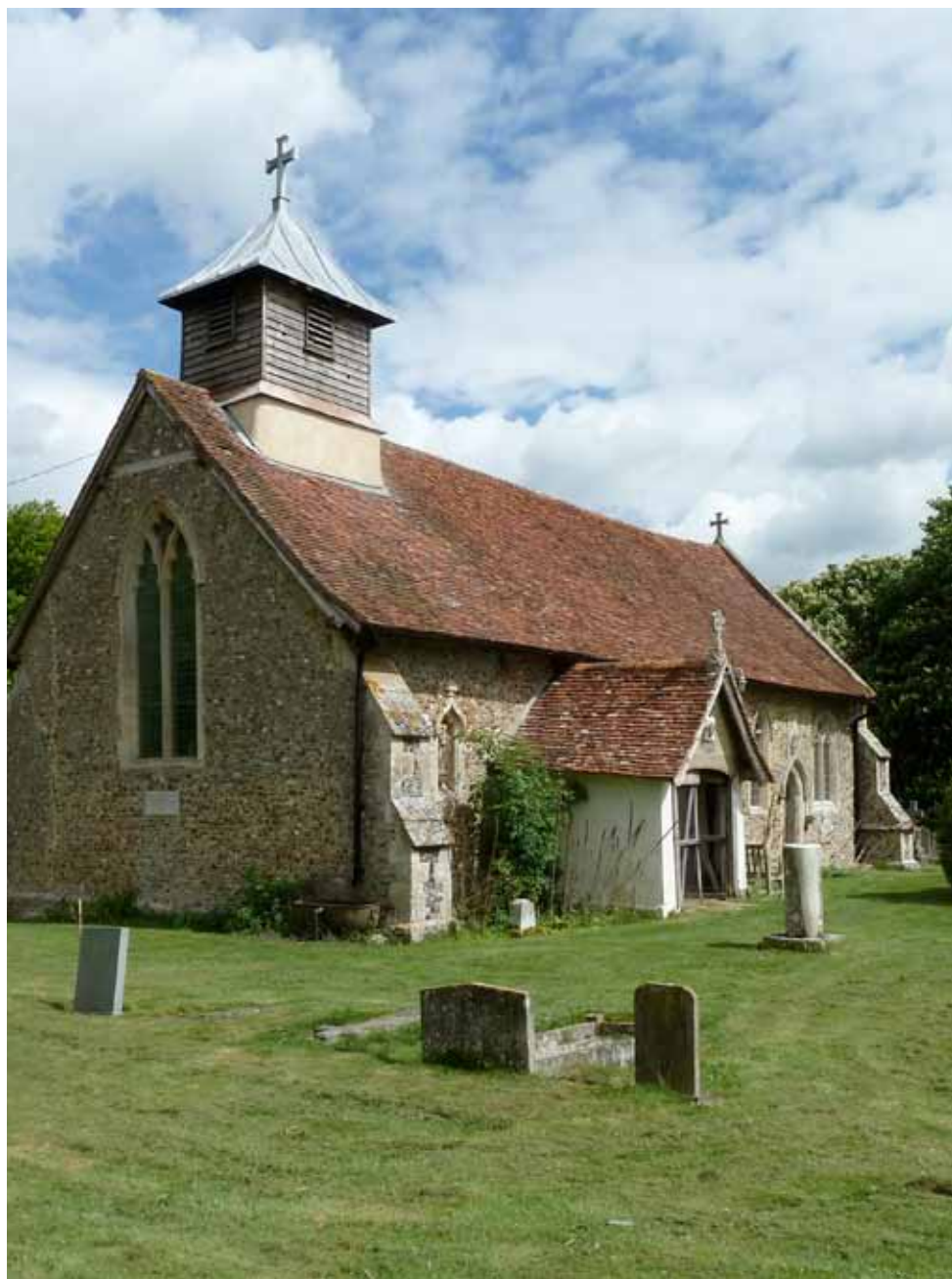
Our Spring Study Day visited Ovington Church.