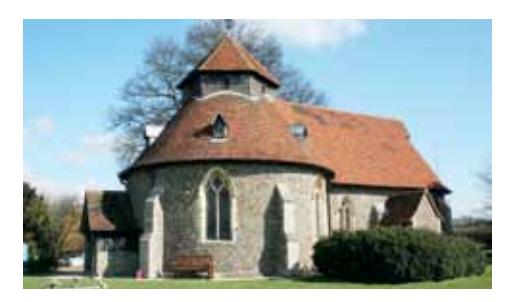
St John the Baptist Church, Little Maplestead.

St John the Baptist, Little Maplestead was awarded a grant of £5,000 from the National Churches Trust for urgent repairs to gutters. The church was put forward for funding by the Friends of Essex Churches Trust.