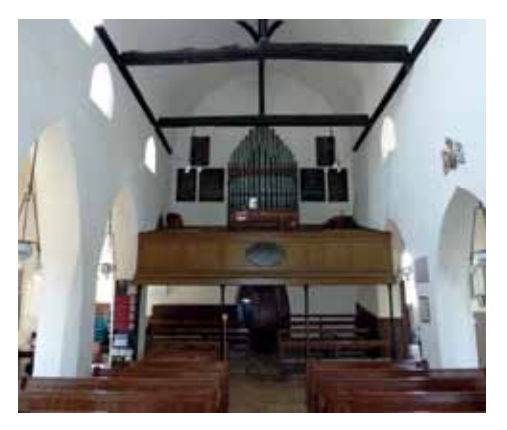
Inside St Peter's church, Boxted

St Helen and St Giles, (a dedication unique in England) Rainham, is in the London Borough of Havering, and is an absolute gem. Built in the 1170s it has nevertheless survived relatively unaltered since that time. We are fortunate to have an exact