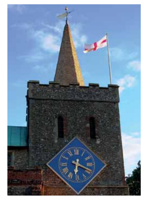
Great Bardfield St Mary the Virgin received £3,000

The grants offered ranged as in the previous year from £1,000 to £10,000 and covered a wide range of repairs. Roof repairs inevitably required the greatest funding and 50 per cent of the offers were in this category. The Baptist church at Burnham-on-Sea was one of these projects, needing an overdue re-slating