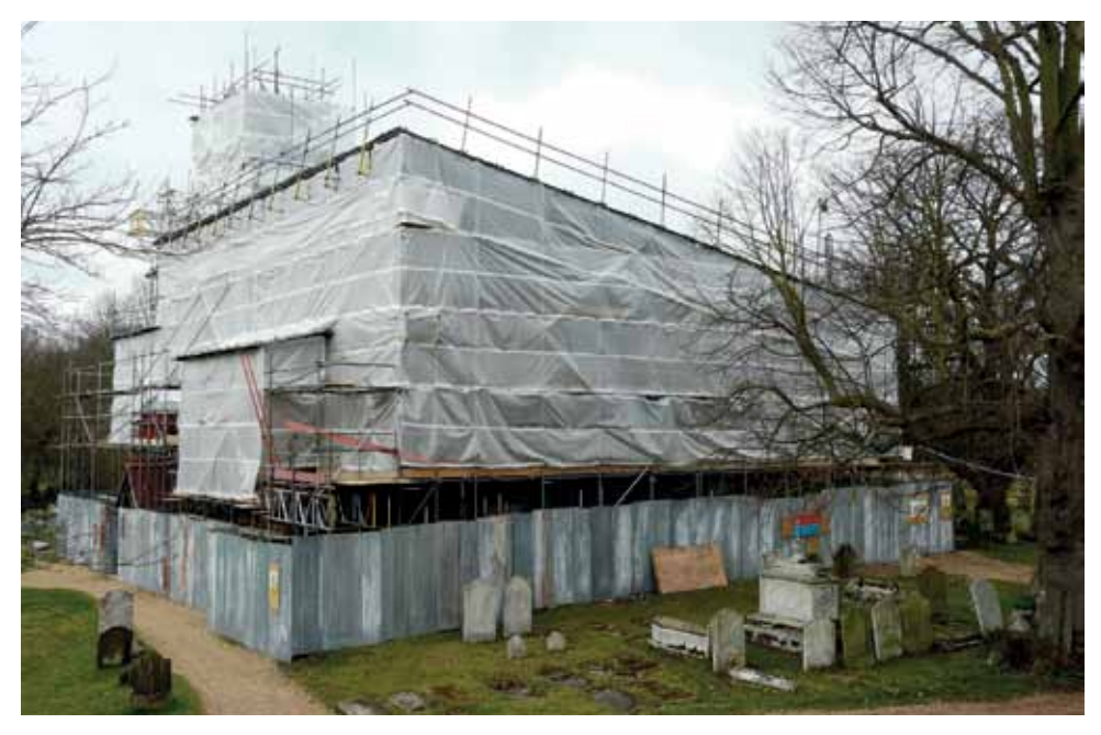
St Peter's, Great Totham under wraps...