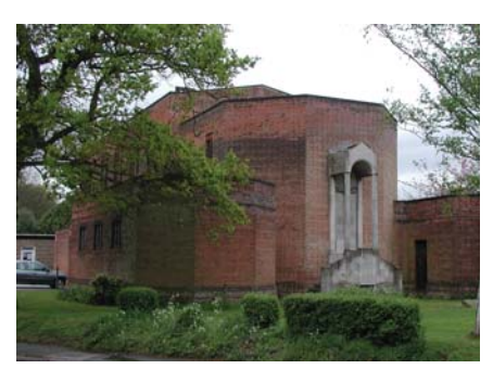
St George's, Brentwood: £10,000 National Churches Trust Partnership Grant

Lastly but most importantly, as you will see from the Treasurer's Report income for 2011 is considerably reduced, and this will affect the grant budget for 2012. The Committee will continue to assess the situation and try to meet the continuing need of parishes, and welcome applications from all Christian denominations.