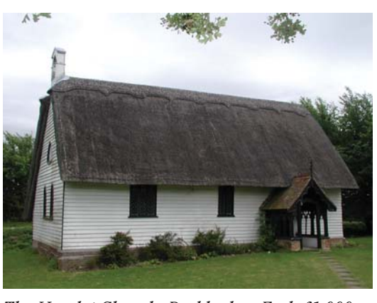
The Hamlet Church, Duddenhoe End: £1,000 for thatching

As usual the Grants Committee met on four occasions in 2011. The meetings were well attended and many thanks should be given to the Committee members and the Secretary, who all give so generously of their time. In addition to the meetings all the parishes who apply for a grant are visited by one of the Committee. The visit is arranged to discover the role of the church in the community and to gain an overall impression of the work to be undertaken. It is also an opportunity