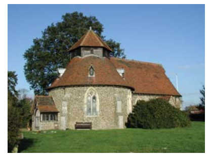
St John's. Little Maplestead: one of England's five round churches

St Giles, Great Maplestead and St John the Baptist, Little Maplestead took us in April to a delightful part of Essex, almost Devon-like, including a little short-lived driving rain! A lovely welcome? Of course, as we find at all churches visited. After an interesting talk about St Giles's we took the short run to St John's, learning much of its history before returning for our W.I. tea. Our AGM followed, where members were respectfully reminded of the slender base of their Committee upon which the future of the Branch depends.