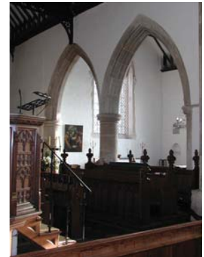
All Saints, Ashdon, looking through to the Turrel Chapel

Then south of the Thames in September to Sir Winston Churchill country at St Mary, Westerham. A change here, for we enjoyed, again with the local W.I., a superb ploughman's lunch, including apple pie and cream. Then up to the heights of the church, with its magnificent views and access to the floral delights of the nearby village