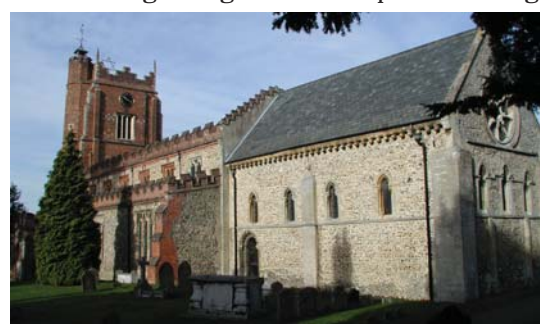
St Nicholas, Castle Hedingham: £5,000 to repair a collapsed flue

30 September 2011 was just over 71%, which means that on a project of £10,000 a payment of £1,420 would be received instead of the previous figure of £2,000. It is impossible to tell whether future figures will rise or fall, and the Grants Committee are taking into account this factor when assessing applications.