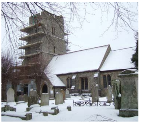
Paglesham: work in progress, December 2010

The Friends of St Peter's was formed and sales of Paglesham Natives swelled the Tower Fund. This helped attract grants from both English