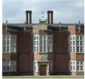
New Hall, Boreham