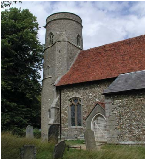
Bardfield Saling: one of Essex's six round towers