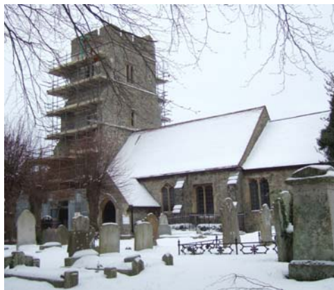
Paglesham: work in progress, December 2010

The Friends of St Peter's was formed and sales of Paglesham Natives swelled the Tower Fund. This helped attract grants from both English