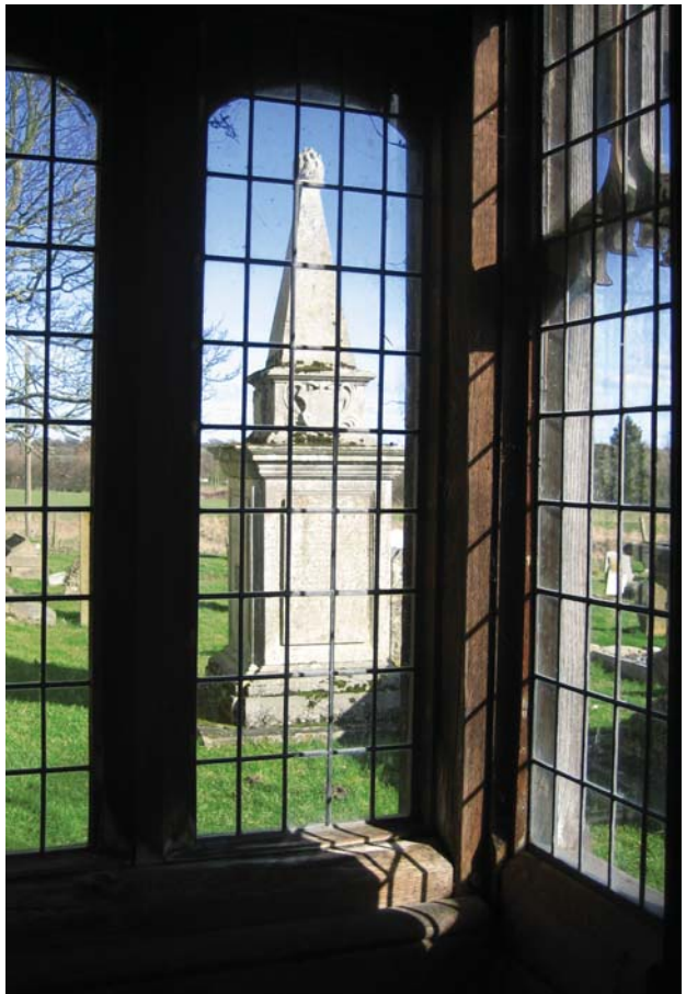
Black Notley: John Ray's memorial