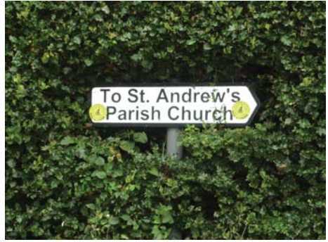
Somewhere in Essex...

The Southend Branch is always an essential element of our activities, and contributed £2,000 to the Trust funds in 2010. I believe this is a record. On behalf of the Trust, I thank everyone 'for all the good work you do'.