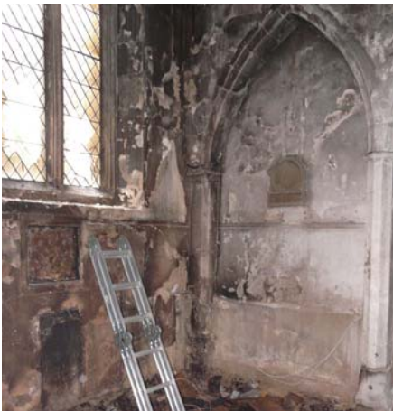
Sheering: fire damage, January 2010