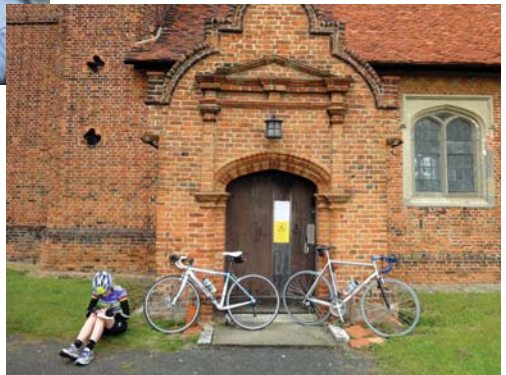
Natalie Snow at Theydon Mount